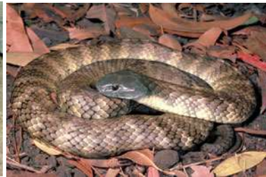
Light banded form