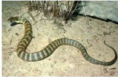
Grey banded form